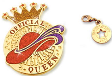
2013 Queen Pin & Star Charm