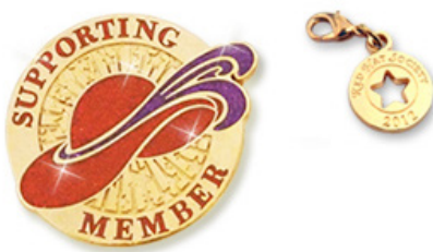
2013 Supporting Member Pin & Star Charm