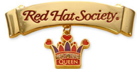
Queen Pin with Crown Charm