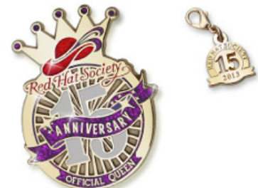
Queen Pin 15th Anniversary with Charm