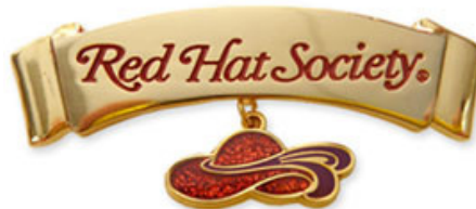
Member Pin with Hat Charm