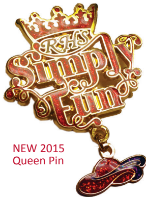
NEW 2015 Queen Pin

These products may be purchased on the RHS website under Shopping and Offers.