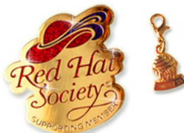
2014 Supporting Member Pin & Cupcake Charm