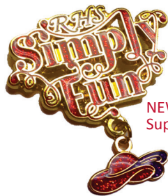
NEW 2015 Supporting Member Pin